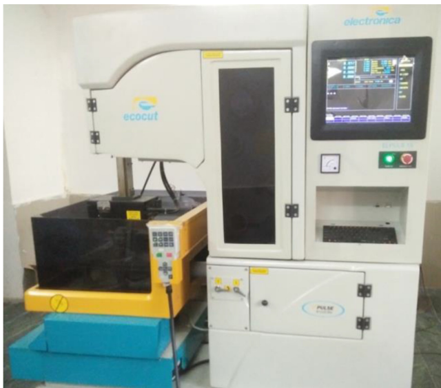
Fig. 1. Experimental set up.

The preference number for each quality characteristic is expressed as follows: